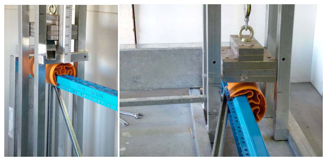
Front Impact Side Impact