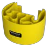
102 Series 100mm (4") high 110-120mm (4.3" - 4.7") wide columns

Protect-it™ offers exceptional performance in pallet rack protection. Warehouse rack damage is a major occupational health and safety issue. Pallet racking is not designed to be struck by fork-lifts. Even low speed collisions can lead to structural damage that is costly to repair and places workers at risk.