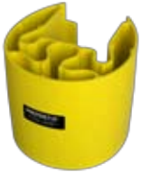
133 Series 133mm (5.25") high 75-85mm (3" - 3.3") wide columns