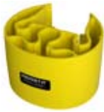
101 Series 100mm (4") high 85-106mm (3.3" - 4.2") wide columns